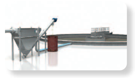
A compact, high efficiency grit separation system.