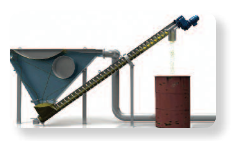
Optional aeration removes floating organic material.